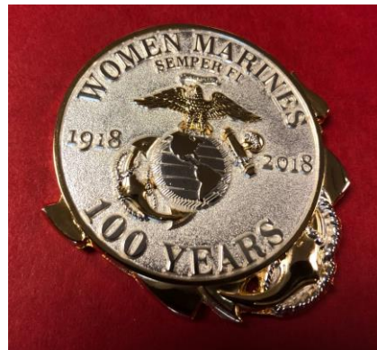
Close ups of Jean Irving challenge coin