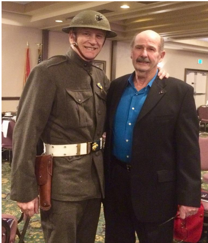
Friends 6 Years